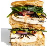
Tofu Sesame King (V)