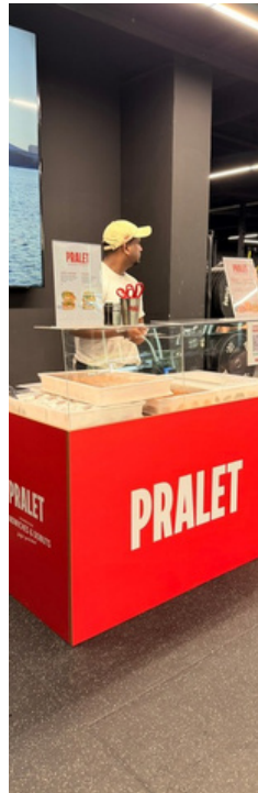
PRALET DONUT CART