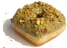
Pistachio Raspberry Crunch