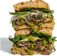
Magic Mushroom (V)