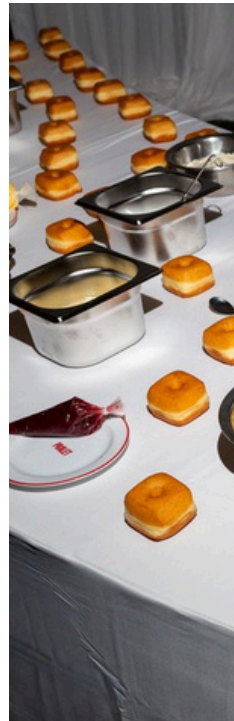
PRALET DONUT TABLE