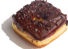
Triple Choc Crunch