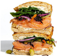
Salmon + Hijiki