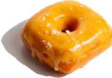
Burnt Butter Honey Glaze